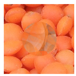
Figure 1: camouflaged circular "prey" overlaid on the background image for which they were evolved (a) tree bark, (b) twisty wire, (c) flowers and leaves, (d) serpentine, (e) lentils